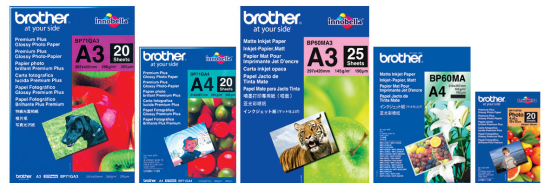
BP71GA3 BP71GA4 BP60MA3 BP60MA BP71GP